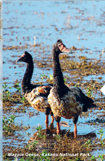
Magpie Geese, Kakadu National Park

Scramble, abseil, slide and dive through gorges on an adventure tour in this remote WA park.