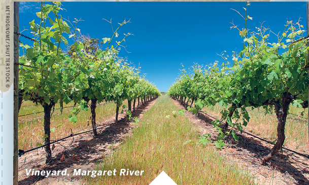
Vineyard, Margaret River

Warm sun, clear skies, shorter queues. Easter is busy with families on the loose. Autumn